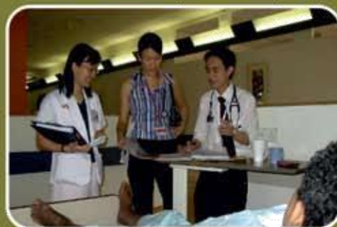
Ward Round Participation