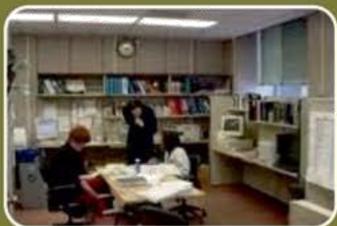
Drug Information Centre