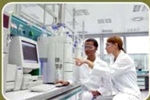
Bio Analytical Research